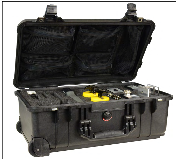
Figure 1. Desco 19790 ESD Survey Kit